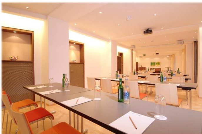
AURA I + II